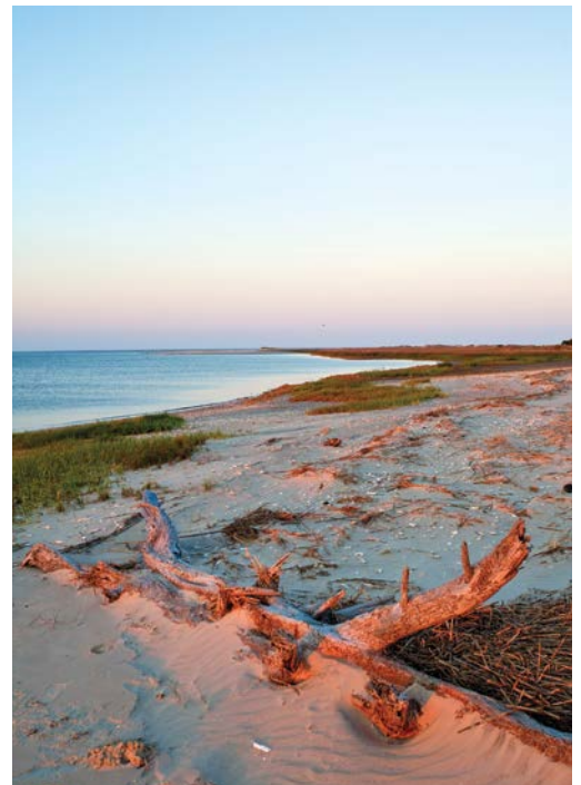
Little St. Simons Beach