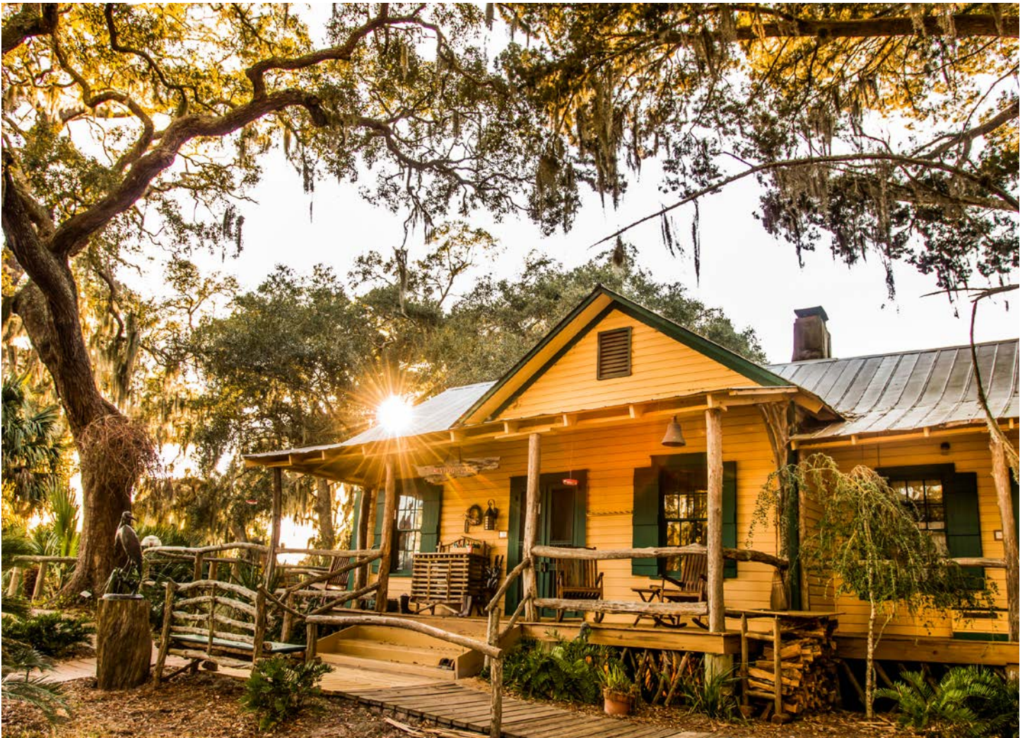
Little St. Simons Lodge