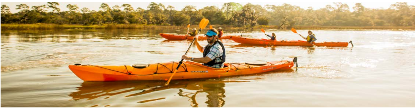
Kayaking on Little St. Simons