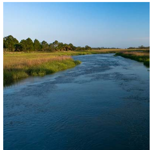
Mosquito Creek