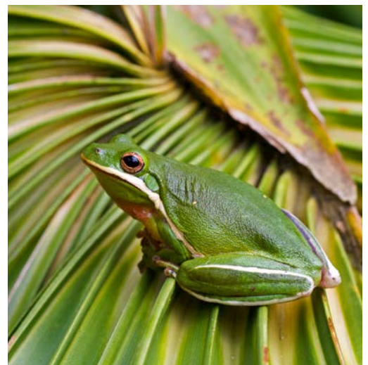
American Green Tree Frog