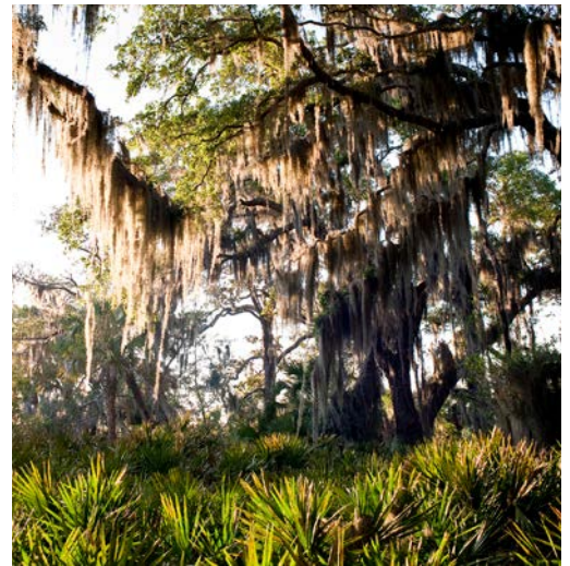
Sun through Moss