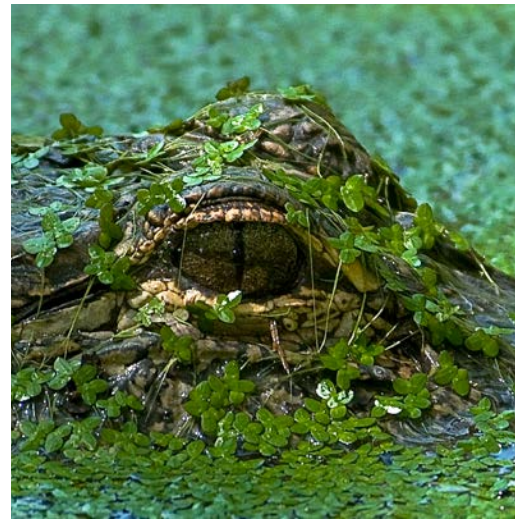
American Alligator