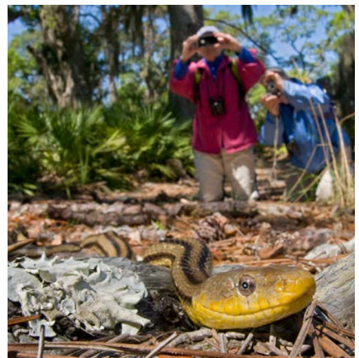
Yellow Rat Snake