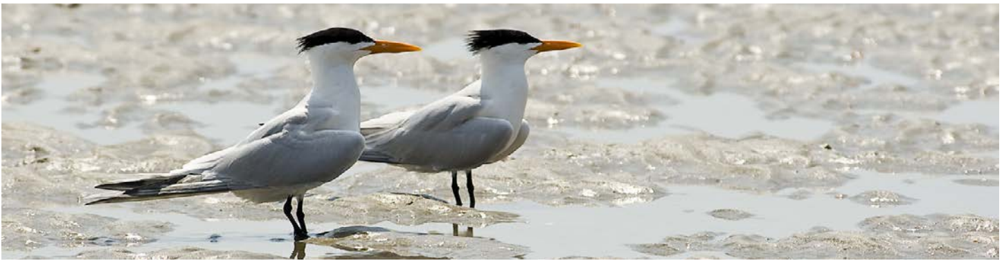
Bird watching © Marc del Santro