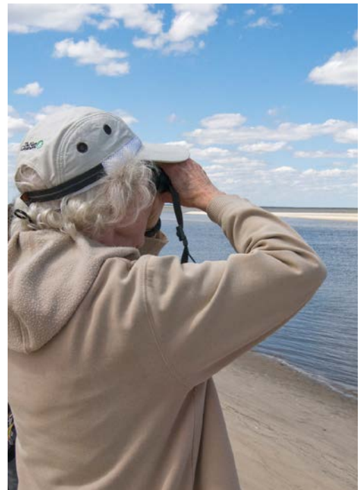
Wildlife Spotting